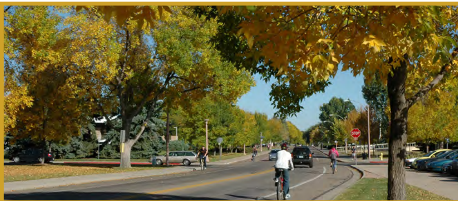
Figure 2. Ash trees comprise an estimated 15 percent to 20 percent of all trees in Colorado cities, neighborhoods, parks and backyards.

In Colorado, EAB was detected for the first time in 2013 in the City of Boulder. As a non-native insect, EAB has no native predators to keep populations in check, and threatens all true ash species ( Fraxinus spp.). As a result, the beetle poses a serious threat to Colorado's urban forests, where ash trees comprise an estimated 15 percent to 20 percent of all trees; the Metro Denver area alone has an estimated 1.45 million ash trees. Green and white ash, including 'Autumn Purple' ash and other varieties, have been widely planted in Colorado due to their fast growth, ability to tolerate urban growing conditions and high aesthetic value. Many of the state's ash trees are located on private property and in parks and other community areas. The future costs of EAB in Colorado, in terms of ash tree treatments, removals and replacements, could exceed 1 billion dollars.