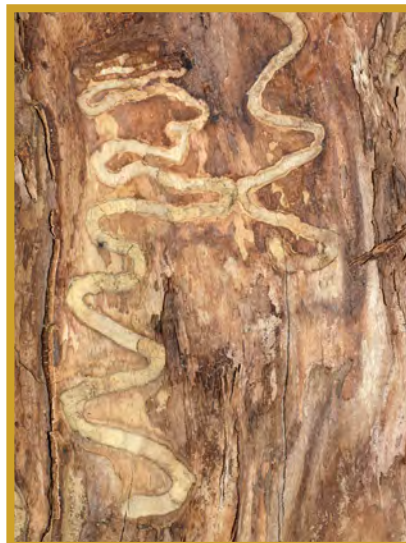
Figure 6. S-shaped emerald ash borer galleries under the bark.

Insects commonly mistaken for EAB include other metallic wood borers and the flatheaded appletree borer. Also, lilac/ash borer exit holes can be mistaken for those left by EAB.