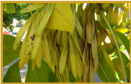
Figure 13. Seeds on ash trees are paddle-shaped. Photo: Franklin Bonner, USDA Forest Service*