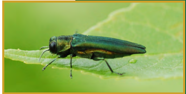
Figure 1. Adult emerald ash borers are approximately 1/2-inch long.

The emerald ash borer (EAB), Agrilus planipennis , is an exotic insect responsible for the death or decline of tens of millions of ash trees throughout the eastern United States and Canada. Native to Asia, the first detection of the beetle in the U.S. occurred in southeastern Michigan in 2002, most likely arriving in the 1990s, hidden in wood-packing materials commonly used for shipping. EAB already has cost impacted communities billions of dollars to treat, remove and replace ash trees. Infestations are difficult to detect, as the larvae reside under the bark, the adults generally are only present from May through September, and ash trees may be infested for up to four years before there are visible signs of decline.