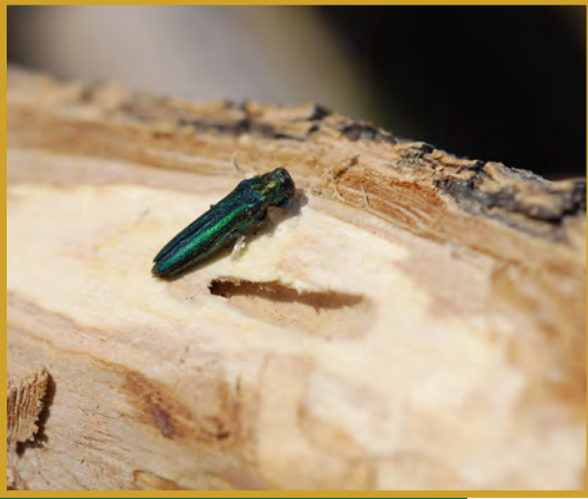
Figure 16. EAB is responsible for the death or decline of tens of millions of ash trees in at least 25 states.

If an ash tree is experiencing dieback or appears unhealthy, have it examined by a professional. Landowners that suspect the presence of EAB in their ash trees should contact the Colorado Department of Agriculture (CDA) at (888) 248-5535 or send an email to CAPS.program@state.co.us .