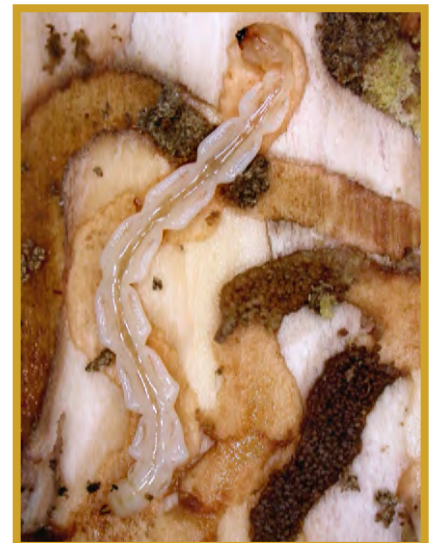
Figure 7. Emerald ash borer larva.