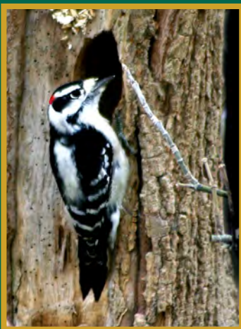
Figure 18. Woodpeckers are an important predator of EAB.