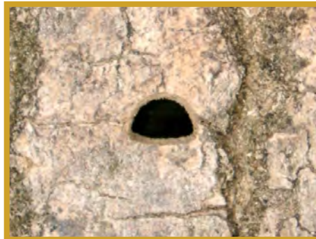
Figure 19. D-shaped exit holes can indicate the presence of EAB. Photo: Pennsylvania Department of Conservation and Natural Resources*