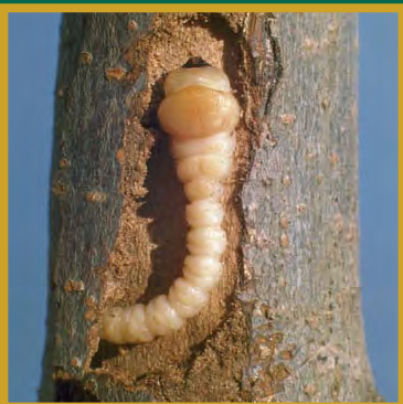
Figure 5. Dead and dying branches on ash trees may be infested with the flatheaded appletree borer.