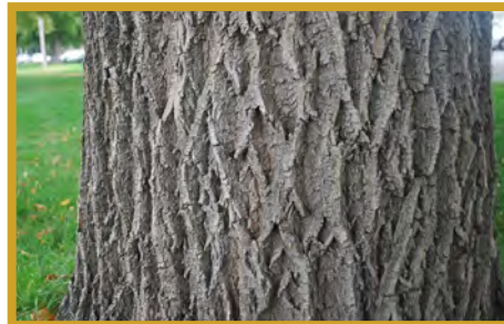
Figure 12. The bark on mature ash trees has diamond-shaped ridges.