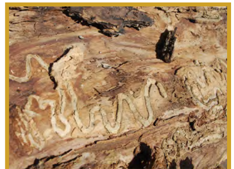
Figure 22. S-shaped tunnels or galleries can be found under the bark of an infested ash tree.