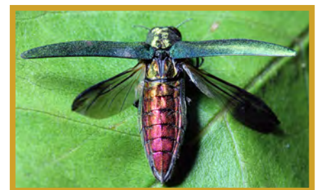
Figure 9. EAB adults have an emerald-green head/back and a coppery reddish-purple abdomen.