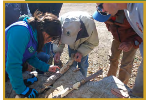
Figure 23. A CSFS forester and CSU Extension specialist assess the branch of an ash tree to determine the presence of EAB.

The decision to chemically treat individual ash trees is a personal preference, and consumers should educate themselves and use caution when purchasing products that claim to protect trees against the pest. Homeowners may opt to periodically apply insecticide treatments to help protect high-value trees; however, the early presence of EAB in Colorado may not warrant immediate preventive treatments in communities where EAB has not been detected. The closer ash trees are to an area of known infestation, the higher the risk that they will become infested by EAB through natural spread. Also, trees within or near the EAB Quarantine area are at a higher risk of infestation through human-assisted spread of the pest, because infested