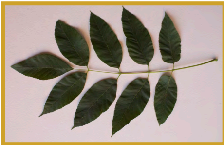
Figure 11. Ash trees have five to nine leaflets on each stalk.