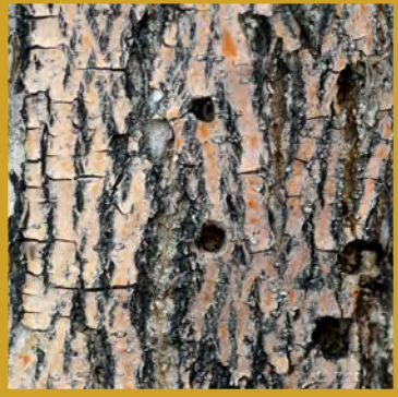
Figure 3. When lilac/ash borers exit an ash tree, they create irregular round holes.