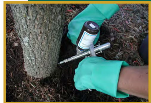
Figure 25. A syringe-like applicator is used to inject imidacloprid to control EAB. Photo: David Cappaert, Michigan State University*