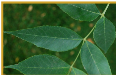
Figure 14. Ash leaves can either have smooth or finely toothed edges.