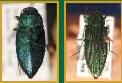
Figure 4. Several metallic green beetles are native to Colorado, including Phaenops gentilis (left) and Buprestis langii (right), both associated with declining or recently killed conifers.