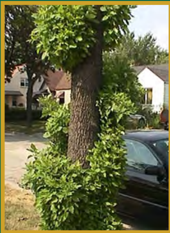
Figure 17. New sprouts grow on the lower trunk of an ash tree infested with EAB.