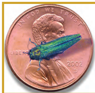
Figure 8. Adult beetles can fly approximately a half-mile to infest a new tree.