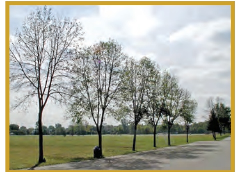
Figure 20. Ash trees may be infested with EAB for up to four years before signs of decline are visible.