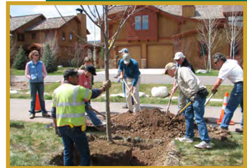
Figure 24. Planning for tree replacement is an effective management strategy for EAB.